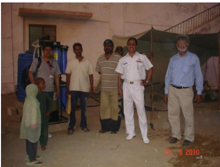
2010 Flood Relief Camp Badin