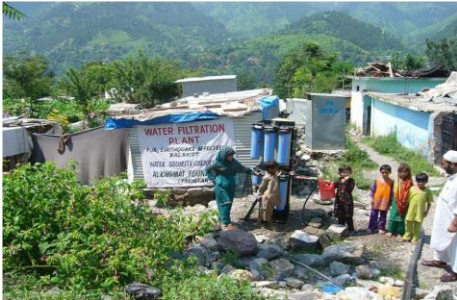
Drinking Water Plant Balakot Earthquake