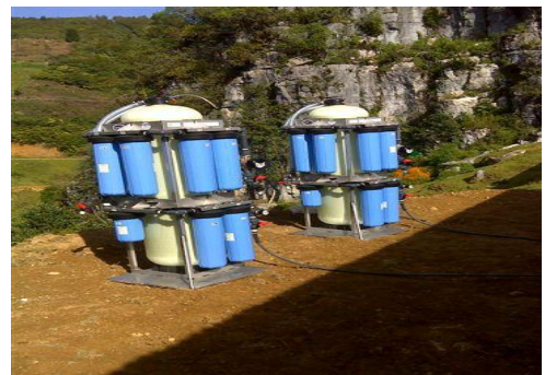
Sold to Flood Relief Chiapas Mexico