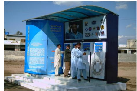
Drinking Water Plant Bara khuo