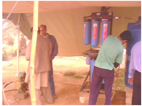
Drinking Water Plant Makli