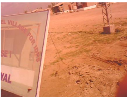
IDPs Rehabilitation Village Thatta

Almadad Foundation has contributed its support and relief services during several disasters, earthquakes and Floods in Pakistan and abroad; Following are few glimpses of the projects in which Tech Group made its contribution;