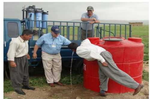
Mobile Drinking Water Plant IRAQ