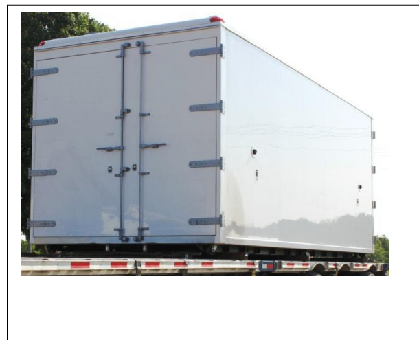
Barley Grass Growing Hydroponic Cabin