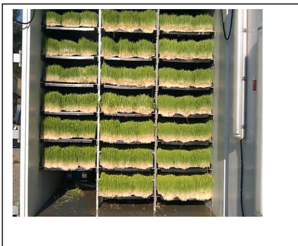
Barley Grass Growing Hydroponic Cabin

The Al-Madad SECURE™ Cattle Farmer Economic Welfare Program assures Human & Cattle Health via State of the Art Waste Management and All Season Green (ASG) Feed Program. The project will consists of Six Large Domes for raring Cattles, Storage etc., with appropriate number of hydroponic Fodder growing cabins, Bio Gas Plant and Electric Generation Facility.