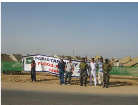
Pakistan Navy Flood Relief Camp