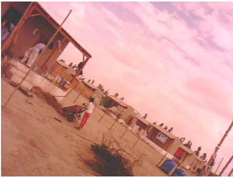
IDPs Village Construction SAJAWAL