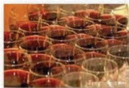
87 glasses of red wine

Each antioxidant molecule from dietary sources can eliminate just one free radical. It is not possible to consume enough to measurably lower oxidative stress levels.