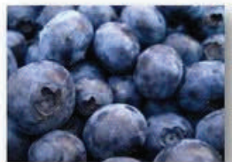
11 pounds of blueberries